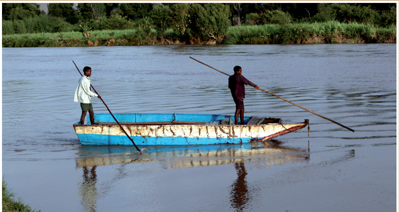
Fishermen on Lake Victoria: upwards of 5000 people die every year due to weather-related events

The next step is to approve the Implementation Plan for the Integrated African Strategy on Meteorology (Weather and Climate Services), which will be presented during the Third Session of AMCOMET in Benin in 2014.