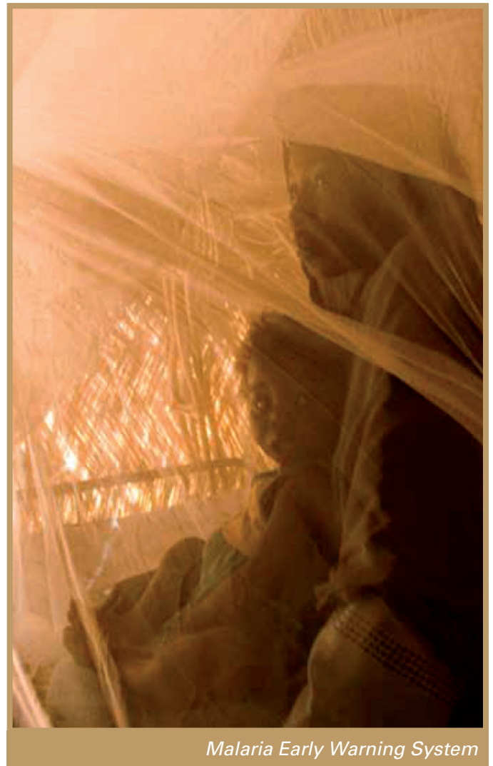
Malaria Early Warning System

➤ In order to tackle seasonal outbreaks of bacterial meningitis in Africa's meningitis belt, WMO is collaborating with the World Health Organization, the International Research Institute for Climate and Society and other leaders within the environmental and public health communities to develop an early warning system for the epidemic. By working in collaboration with the Health and Climate Partnership for Africa, the early warning system will enable efficient use of resources and add value to weather forecasts from a health-service user perspective. The main objective of the programme, which also operates in Asia, Europe and North America, is to reduce and mitigate the consequences of disasters caused by natural hazards and reap the societal and economic benefits of improved high-impact weather forecasts.